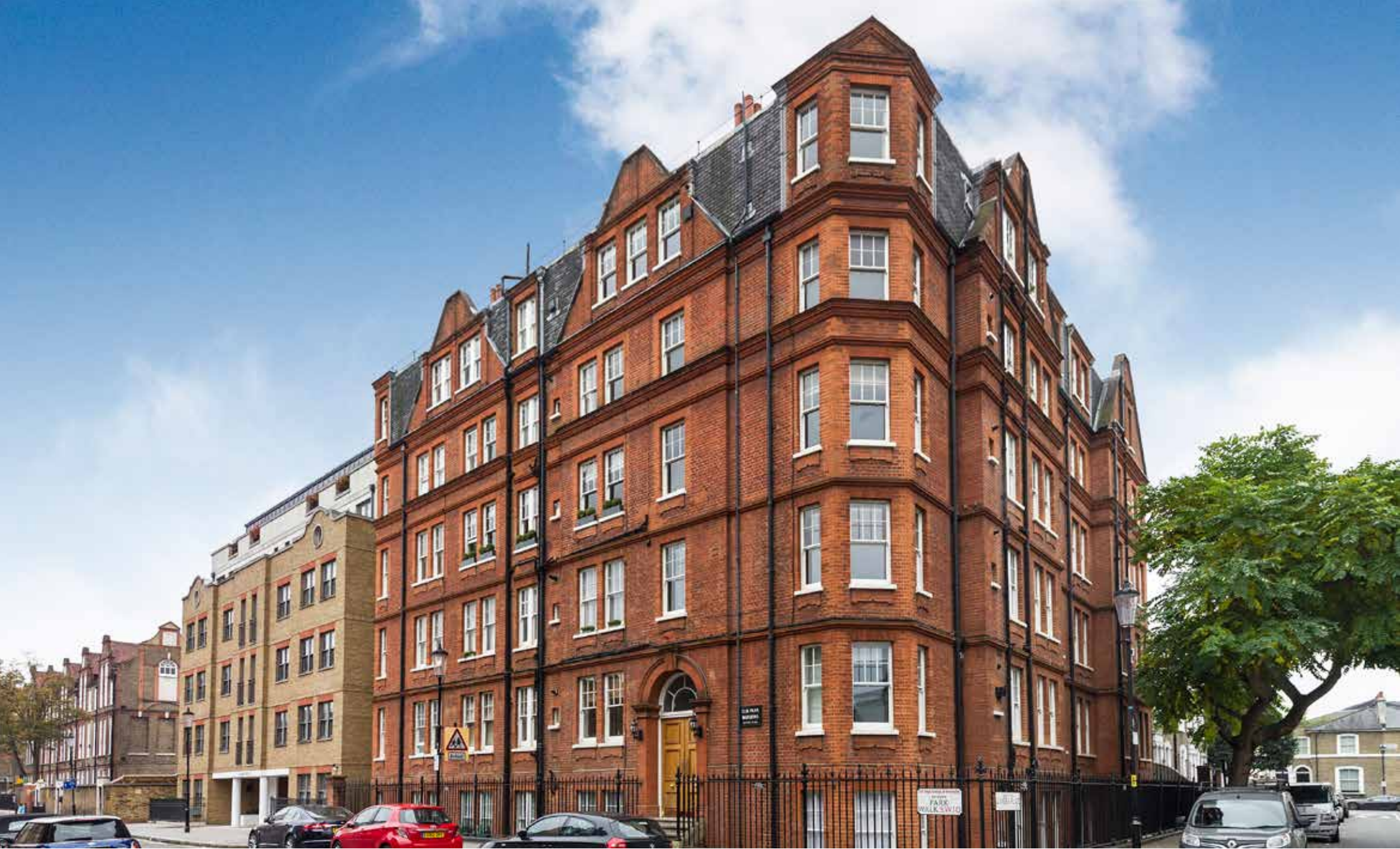
ELM PARK MANSIONS LONDON SW10